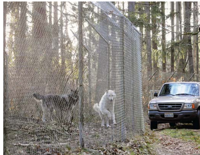
Above: Noah in 2008. Noah and Sequra always leapt for joy at the arrival of the food truck (spring, 2009).

Once Noah found out that this new move included girls it made