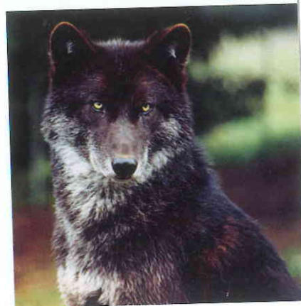
Above: Onyx as a youngster Center: Wolf Haven fir tree

I sat with him the whole afternoon while the sedative wore off, worrying that he would never forgive me. I gently stroked his head as he tried to watch me through groggy eyes while drifting in and out of a hazy sleep. Each time I took my hand away, he