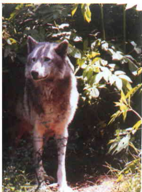
M'ijo.

M'ijo's journey in our world began in spring of 1993 when he was born in Canada. At a mere 10 days of age he was taken from his mom and sold in an illegal pet trade to people in California. At the age of 6 he began showing signs of aggression toward people and so his life here at Wolf Haven was to start. He was brought here in 1999 and paired with a young female wolf, Angel. M'ijo and Angel warmed up nicely to one another, but M'ijo's shyness toward people prohibited him from being on tour. M'ijo and Angel spent the next six years together, playing and enjoying one another's company.