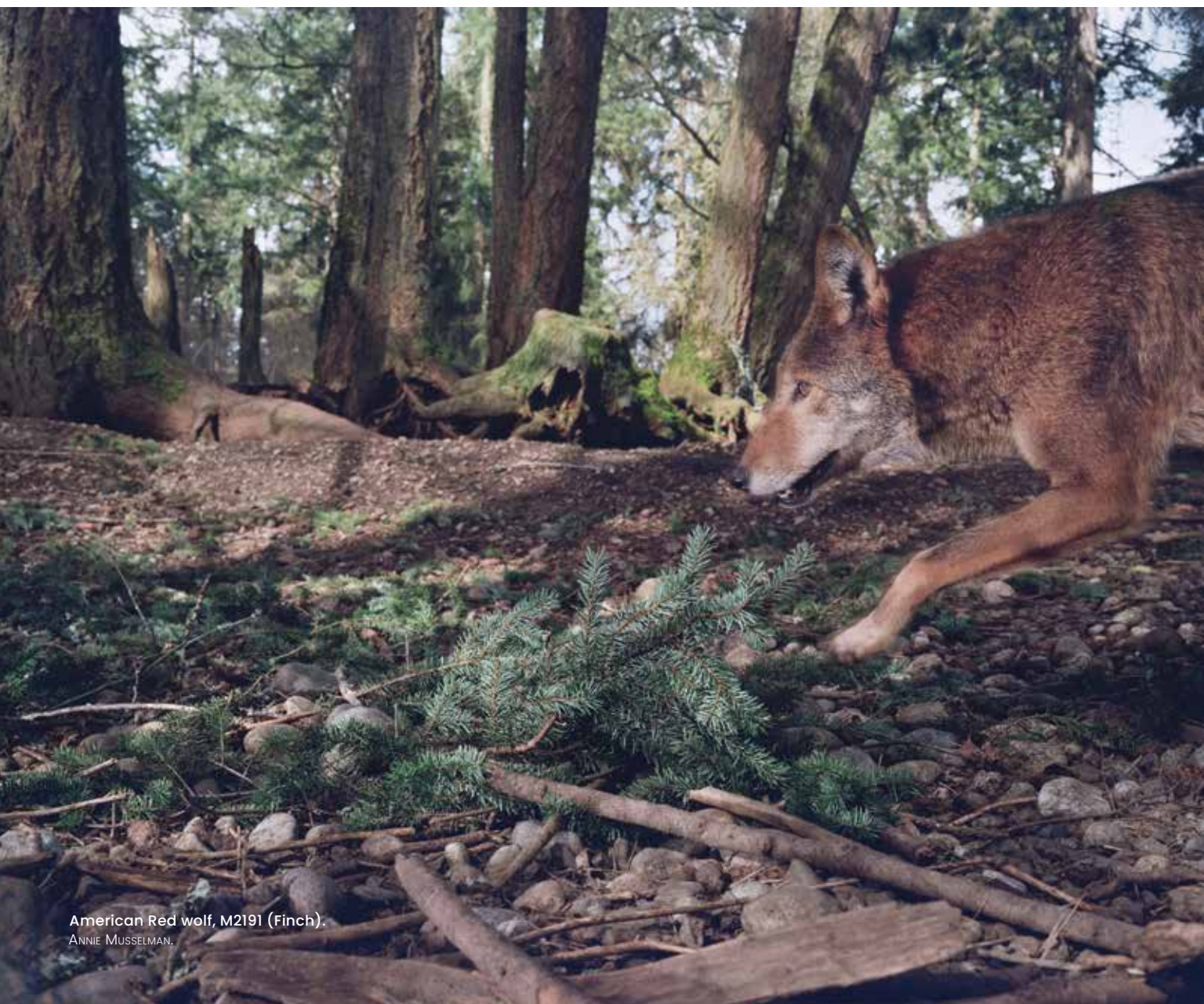
American Red wolf, M2191 (Finch).