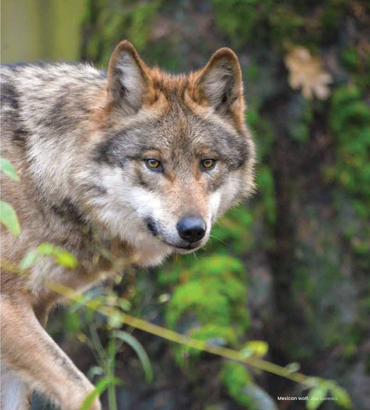
Mexican wolf.